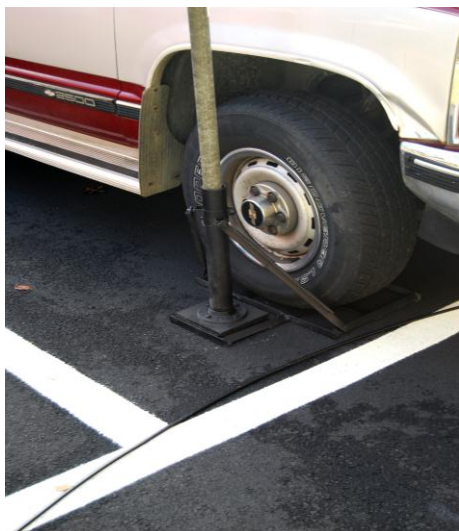
Drive-on mount for erecting an antenna on a push-up pole

The Weldon Spring EOC had two damage assessment teams in the field and reported damage from their city EOC in City Hall.