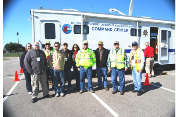
ARES® Responders Outside County ICC

St. Charles County ARES responded in force with the County DEM Interagency Command Center (ICC) as staging outside the St. Peters Justice Center (EOC).