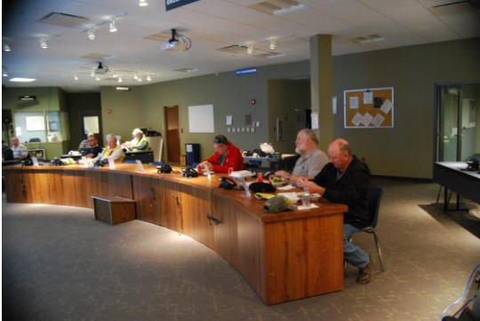
Lunch provided by County DEM

expressed their appreciation for the exercise and the planning effort that went into preparation for it. They also expressed how important ARES® is to their emergency operations as eyes in the field and boots on the ground.