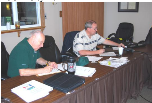
Weldon Spring EOC logging damage assessment traffic

The Weldon Spring EOC had two damage assessment teams in the field and reported damage from their city EOC in City Hall.